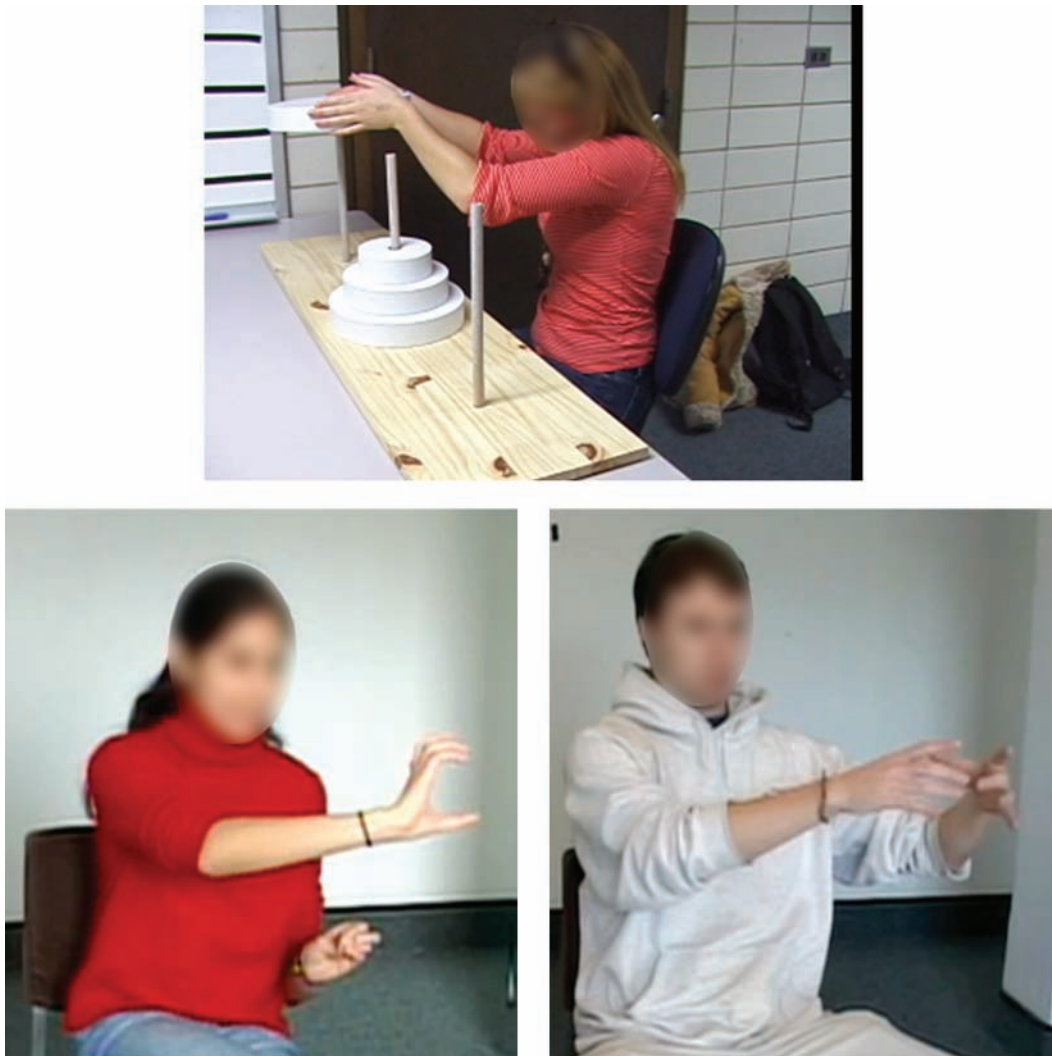
Fig. 1. Illustration of the Tower of Hanoi task and participants' gestures in explaining how they solved the task. The photograph at the top shows a participant using two hands to move the largest and heaviest disk from one peg to another in the first task (TOH1); the four disks weighed 2.9, 2.3, 1.6, and 0.8 kg, respectively. Although the smallest disk was the lightest and could be moved with one hand in TOH1, participants produced one-handed (bottom left) and two-handed (bottom right) gestures while explaining how they moved that disk.

both speech and gesture to explain how they solved the problem, and (c) solved it again (TOH2). For all participants, the smallest disk in TOH1 was the lightest (0.8 kg) and could be lifted with one hand. For some participants ( no-switch group ), the smallest disk remained the lightest in TOH2. For other participants ( switch group ), the smallest disk was switched to be the heaviest (2.9 kg) in TOH2 and, because it was so heavy, could be lifted only by using two hands.